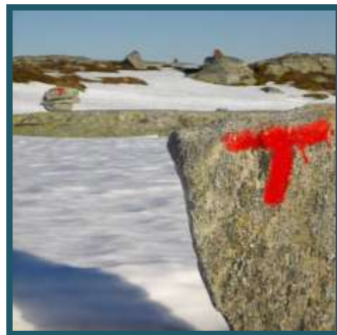
Marked trail on the Fjordruta

Saturday September 20 th 2014 at the Grosvenor Museum