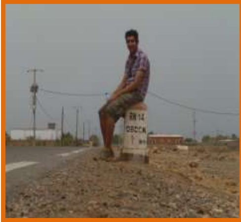
Awaiting transport on the road to Obock, Djibouti