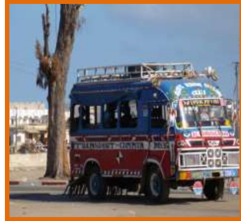
Local transport, Saint-Louis, Senegal